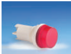
Indicating Lamp Red