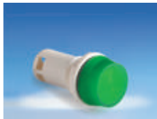
Indicating Lamp Green