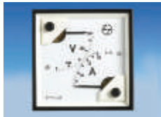
Volt - Ammeter