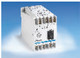
SPPR Type Z5