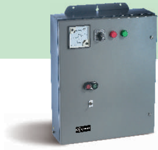
MUG30 Submersible Pump Controller