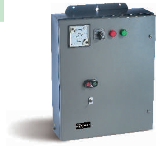
MUG50 Submersible Pump Controller